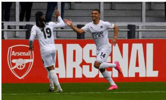
Boreham Wood v Hornchurch