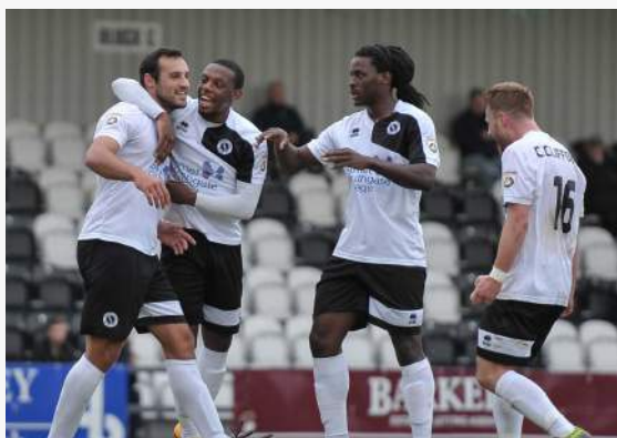
Boreham Wood v Hornchurch