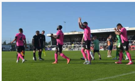
Boreham Wood v Hornchurch